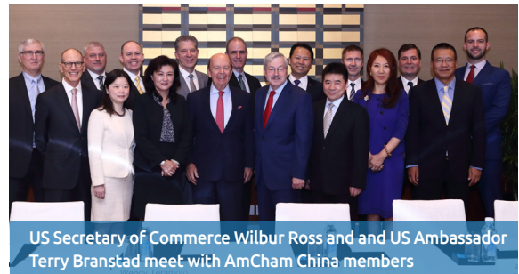
US Secretary of Commerce Wilbur Ross and US Ambassador Terry Branstad meet with AmCham China members