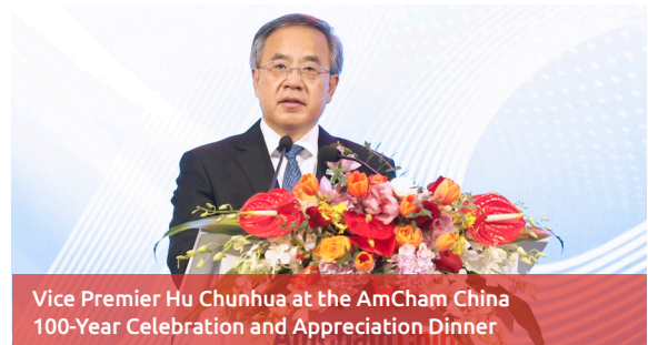
Vice Premier Hu Chunhua at the AmCham China 100-Year Celebration and Appreciation Dinner