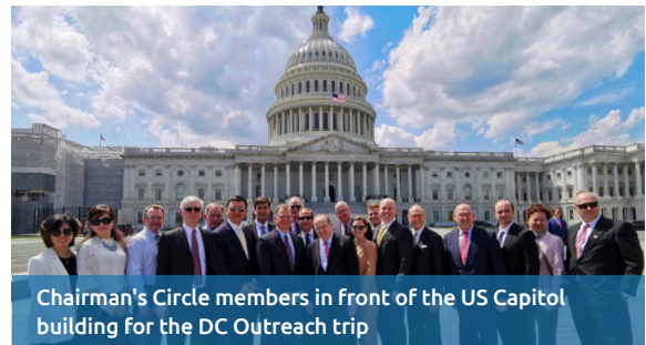
Chairman's Circle members in front of the US Capitol building for the DC Outreach trip