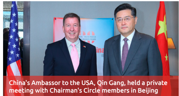
China's Ambassador to the USA, Qin Gang, held a private meeting with Chairman's Circle members in Beijing

20% discount on tickets for Business Climate Survey and White Paper launch events, policy briefings at hotels, and BIO trips.